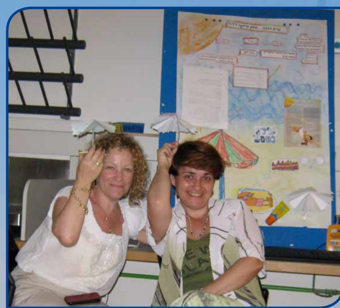
1 st presentation of the Sunscreen module at the 2011 PROFILES course

Getting a sunburn or increasing the risk of skin cancer is an everyday situation, of youth as well as grownup population in the Mediterranean countries. Decisions whether to put on sunscreen, which kind and what is the best way to use it are essential. This PROFILES module allows the students to gain knowledge in order to be able to make better and more educated decisions. Research and inquiry are held in the scientific as well as the social fields.