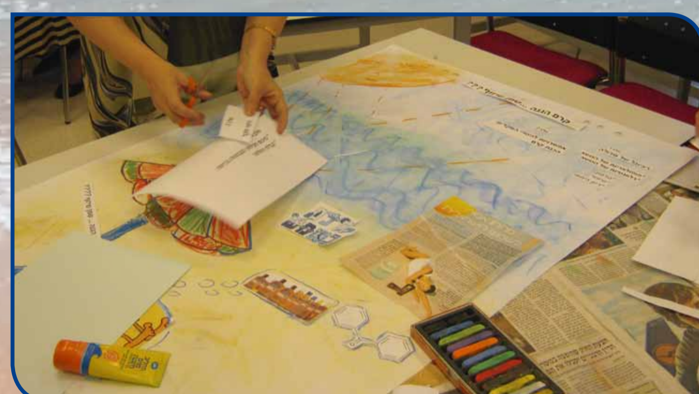
preparing a poster presenting the Sunscreen module's rationale