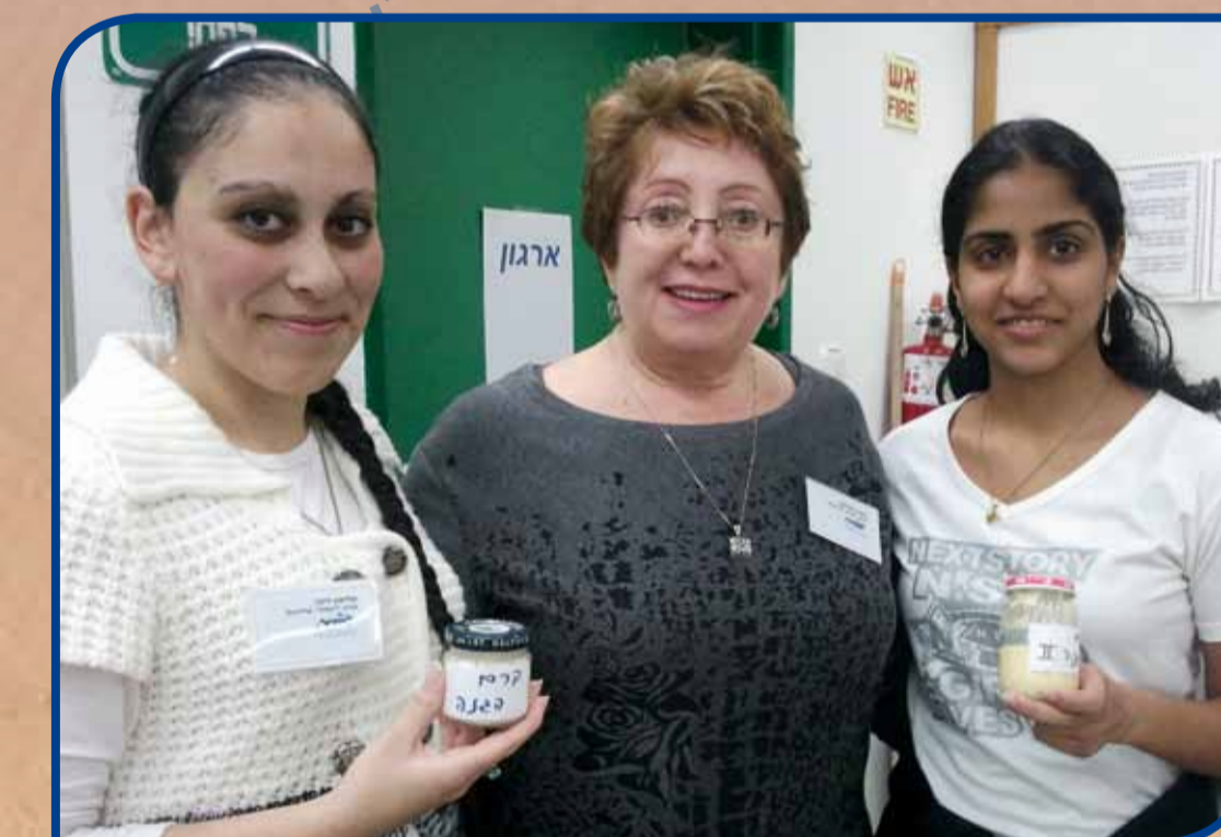
presenting the self-made sunscreen lotion